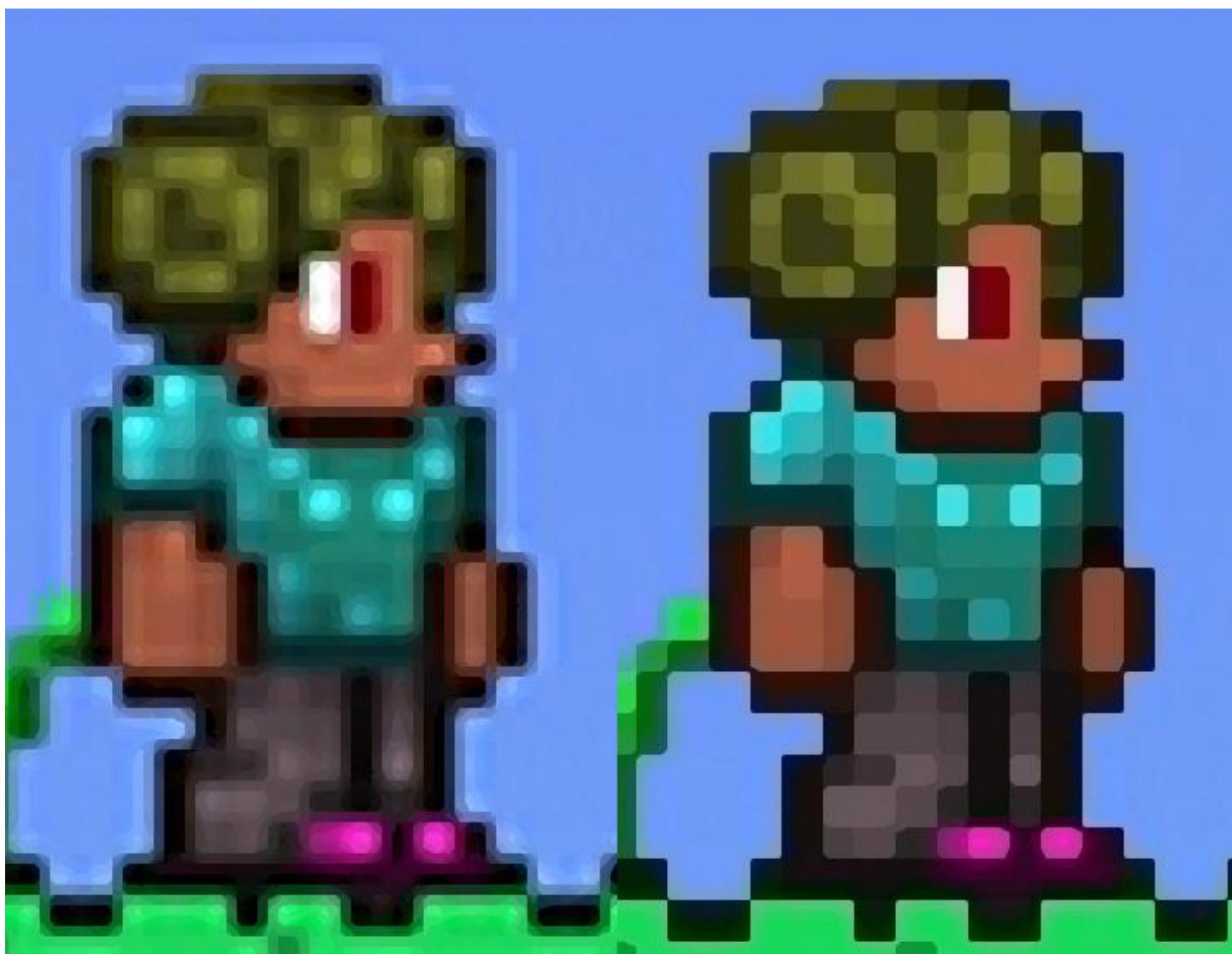
Retro Scaling OFF

Here's a peek at the benefit that Retro Scaling can bring to pixel-art games – the difference is dramatic!